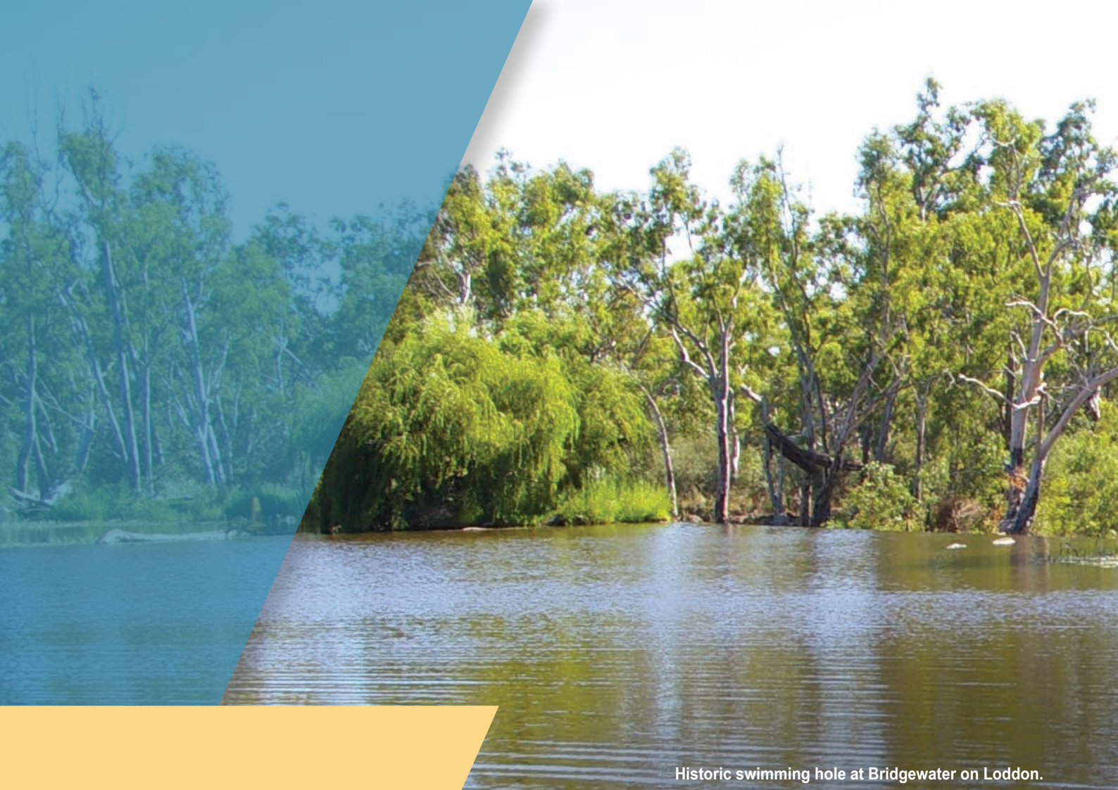
Historic swimming hole at Bridgewater on Loddon.