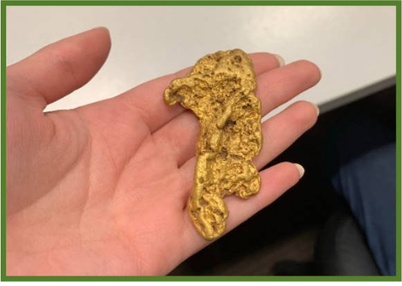
(The nugget cleaned up)

The nugget, first ever found by this lucky prospector, was ten centimetres below the surface. He was surprised by the find as he was searching for coins at the time.