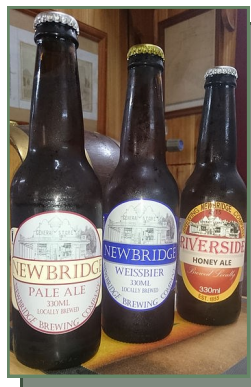
Left to right: Pale Ale Weissbier Riverside Honey Ale

The store itself really focuses on food and drink and has done for many years.