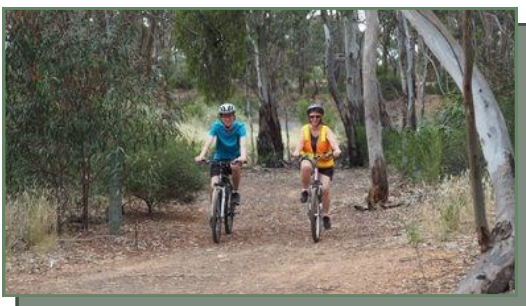
Riders enjoying the ambience of the Queens Gully Trail

The cycling and walking trails in Loddon provide another fantastic outlet for people to get out and enjoy the Shire's scenic environment with addition to walking, the trails are designed to be family-friendly rides.