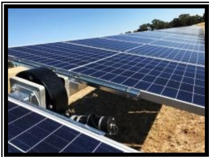
Solar panels at Ceramet Solar Bridgewater

Bookings for these tours can be made through the Loddon Visitor Information Centre on (03) 5494 3489. Read more: