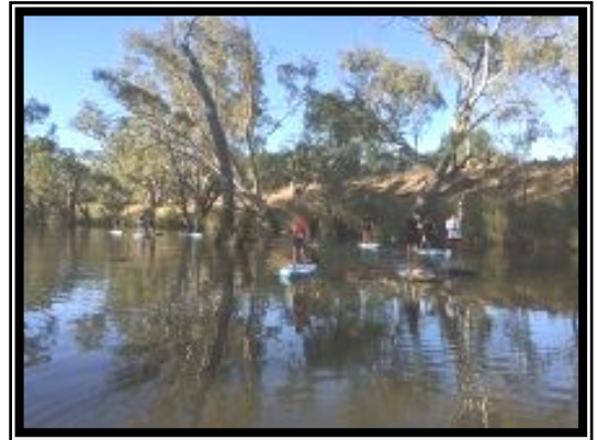
Paddleboarding on the Loddon River