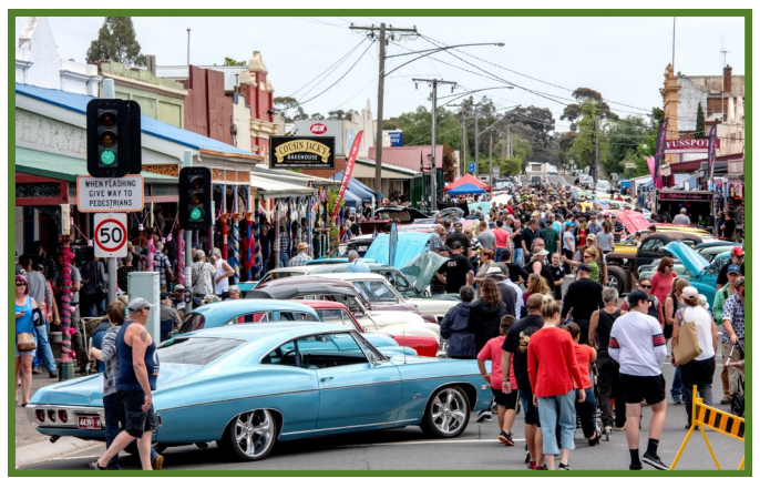
(Inglewood Alive 2018)