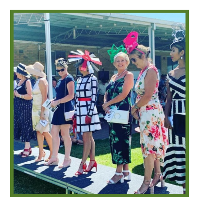
(Fashions on the Field)