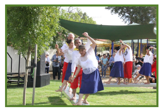
(Sayaw Sa Bangko)

old, coming together to celebrate and have a fun time. It's what small country towns are all about.