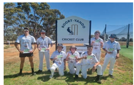
Boort-Yando Cricket Club

Café 3517 in Inglewood will soon be offering vouchers as part of the project as well.