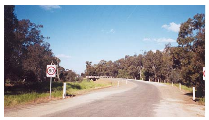
Serpentine Creek - people often stop for a fish or a picnic

A great way to develop our tourism/leisure industry.