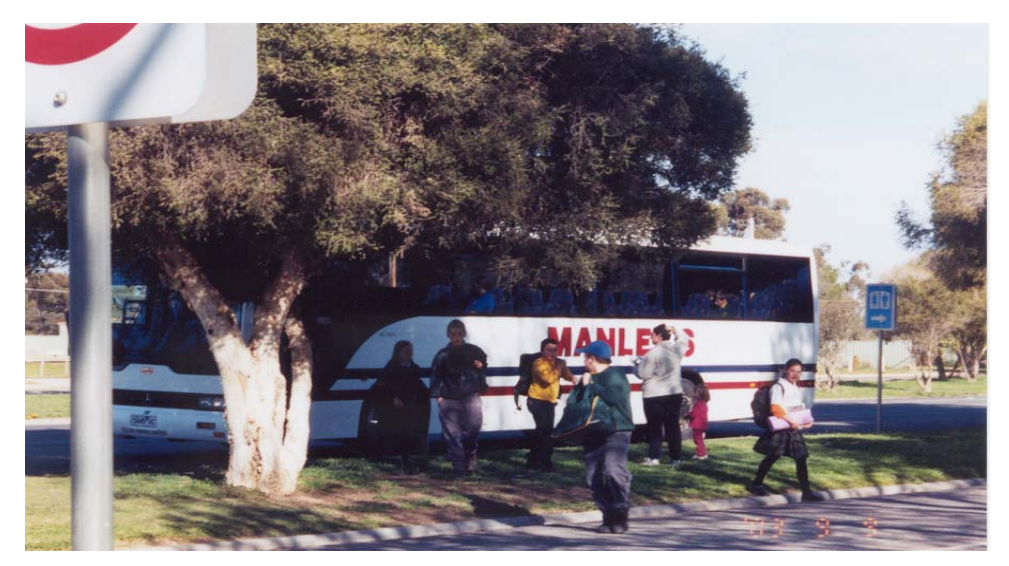
In afternoon get off at medium strip