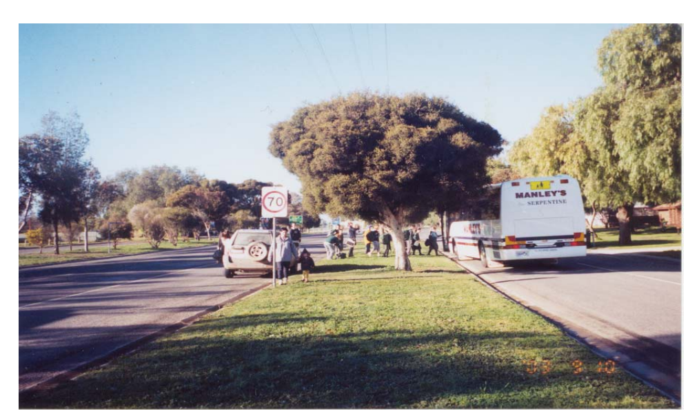
School children wait on medium strip to get on bus in the morning

School bus at shire offices to pick up and drop off by driving into access road, children to be collected and dropped off from Rudkins Reserve both morning and night.