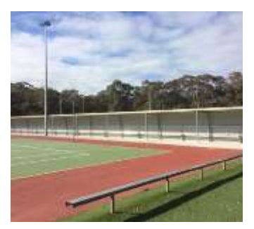
New Shelter Netball & Tennis courts