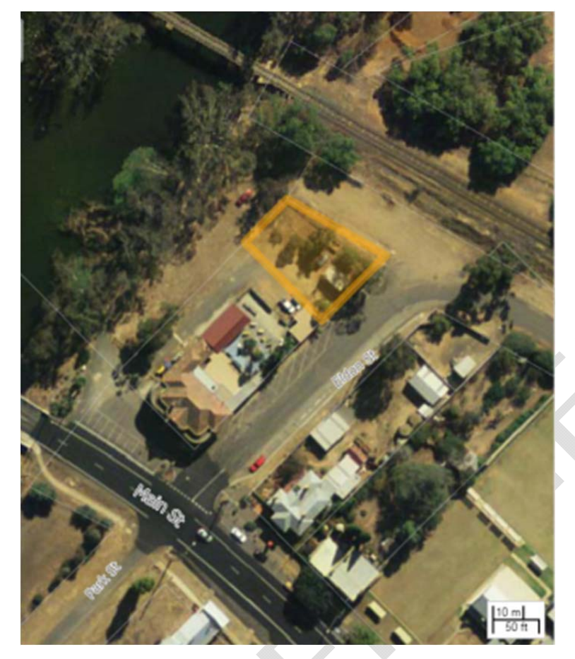
Figure 1: Subject land and surrounds.

The proposed use is defined as a dwelling under the provisions of the Loddon Planning Scheme. A dwelling is a Section 1 use in the Township Zone and does not require a permit subject to the zone, however the land is also covered by a Heritage Overlay (HO) and a Land Subject to Inundation Overlay (LSIO). A permit is required to construct a dwelling under the HO and the LSIO.