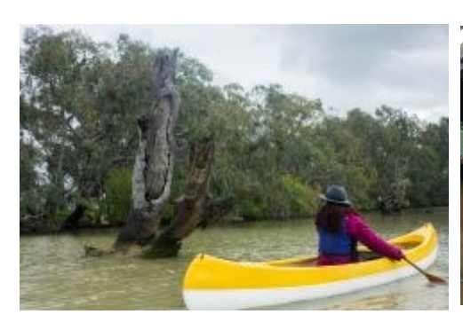
Serpentine Creek Canoe Trail