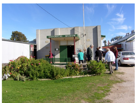
Pyramid Hill and District Historical Society