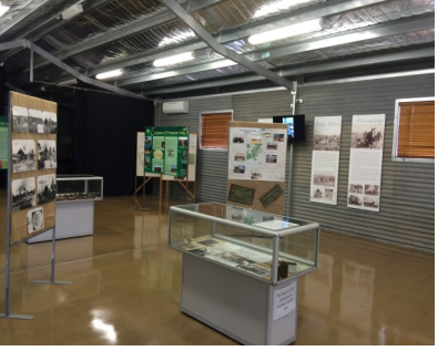
Eucalyptus Distillery Centre Inglewood