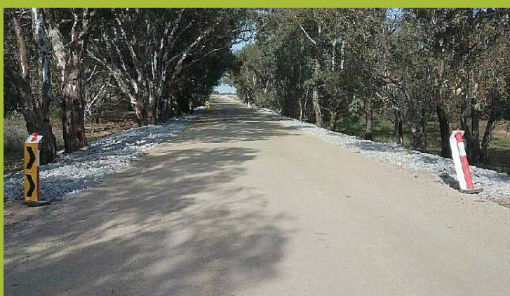
Before and after: More than 2000 defects were identified across the Shire after flooding in September and October 2016.

Works are anticipated to ramp up during the warmer months to restore infrastructure following widespread flooding in the Shire in September and October 2016.