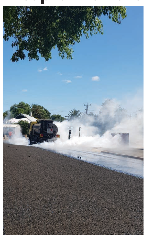
The 2018/19 Draft Budget contains $4.2m for works on infrastructure projects, including road reseals and construction.

Released for public comment on 14 May, Council's 2018/19 Draft Budget has seen Council remain in a strong cash position, with a small surplus and no new borrowings. It proposes a 2.25 per cent average rate rise in line with the State Government's rate capping level.