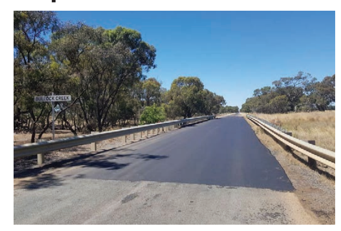
Flood restoration works have been completed (pictured, right) at the bridge over Bullock Creek on Echuca Serpentine Road

Council continues to make progress on flood damage restoration projects across the Shire. In April 2018, approximately $5.9 million had been committed towards flood damage restoration including completed projects, awarded projects and material costs.