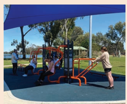
Community members came together to participate in filming at the outdoor fitness equipment at Nolen's Park in Boort.

The videos will be shared with the community when complete. You will be able to access these through the