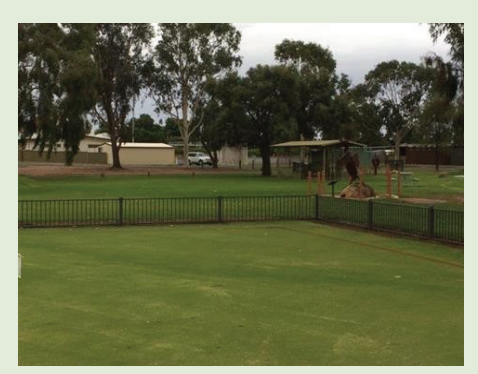
Boort Lakeside Croquet Club Inc. boundary fence replacement – stage 1. Funding from the Community Grants Scheme will go towards stage 2 of the project.

In addition, Boort Tourism Development, Boort Angling Club and Bridgewater on Loddon Development Committee, Wedderburn and Regional Theatre Society, Wedderburn Community Centre and Wedderburn Development Association received funding.