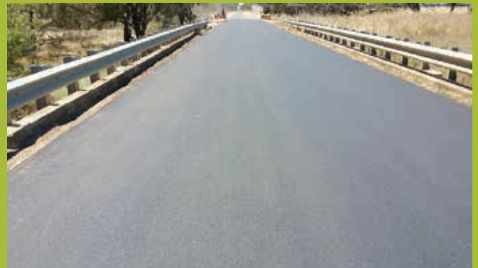
Flood restoration works have been completed at the bridge over Bullock Creek on Echuca Serpentine Road (pictured, right).

Works on flood-damaged roads are continuing across the Shire, with construction works underway following the awarding of a number of jobs to contractors.