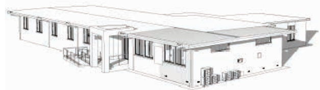
Works for the BRIC extension (shaded section, right) have commenced.

Funding for the $280,000 project has been made possible thanks to the Victorian Government's Living Libraries Infrastructure Program ($240,000), the Boort Resource and Information Centre ($20,000) and Council ($20,000).