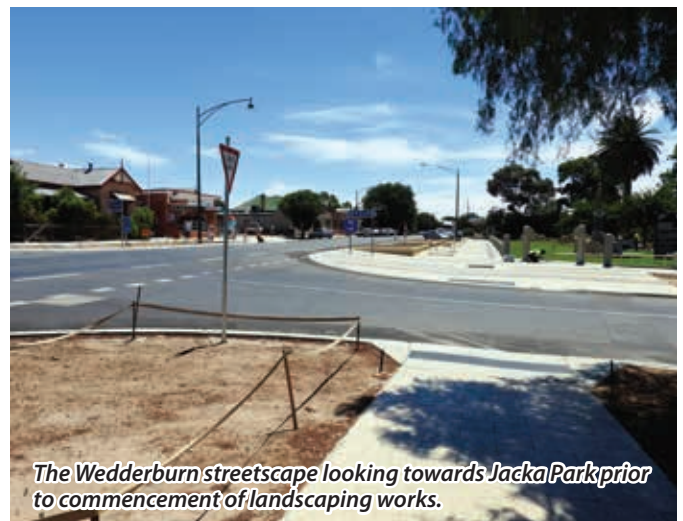
The Wedderburn streetscape looking towards Jacka Park prior to commencement of landscaping works.

Funding for the Wedderburn Streetscape Improvement Project was provided by the Federal Government ($1.3m) and Regional Development Victoria ($500,000) as well as Council.