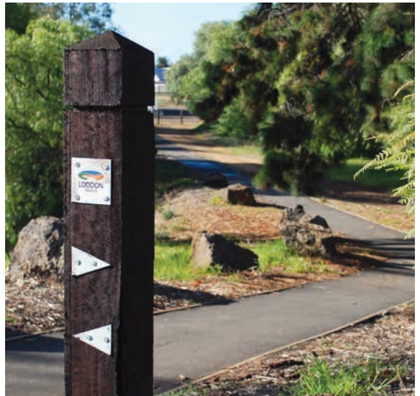
Stage 1 of the Bridgewater Foreshore Project will add to and enhance work already completed along the Loddon River, including connection of the foreshore's pathway.

The project adds to and enhances work already completed along the Loddon River at Bridgewater. These works involved the redevelopment of the swimming hole, connection of the