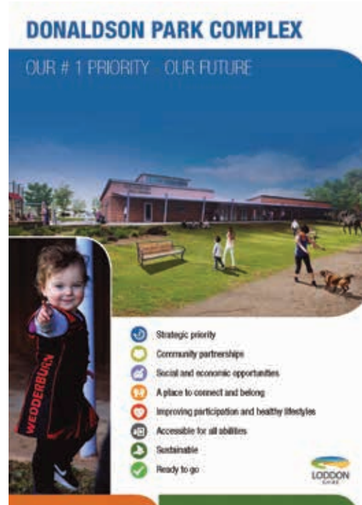
Community fundraising for the Donaldson Park Redevelopment Project is continuing, after the launch of concept plans in February.

https://asf.org.au/projects/donaldson-park-reserve-committee-of-management .