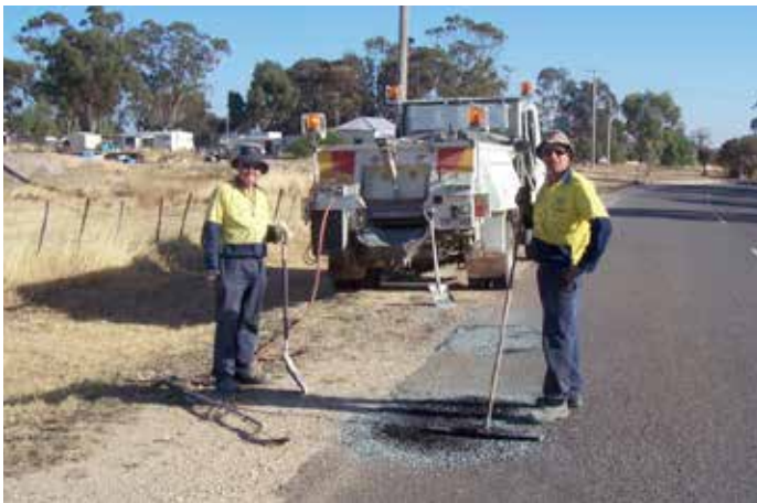
Flood recovery worker Richard Smyth (right) works with Council patrolman Bob Montebello repairing the Boort-Wedderburn road near Korong Vale.

The massive task of rebuilding roads and town infrastructure after the floods of 2010/11 is nearing an end, with Council's exhaustive two-year flood restoration program due to be completed next month.