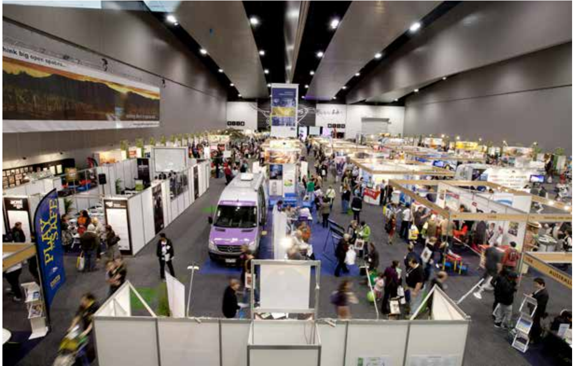
Loddon Shire is gearing up for the Victorian government's second Regional Victoria Living Expo, planned for the Melbourne Convention and Exhibition Centre from 19-21 April. Organisers are expecting up to 10,000 visitors and 150 exhibitors. Report, Page 3