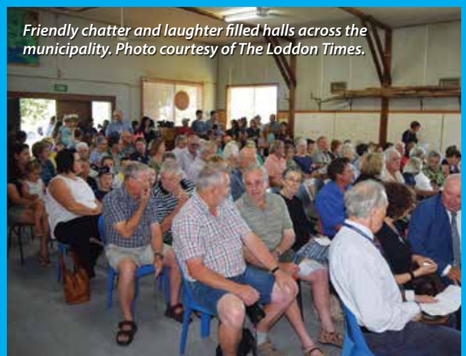
Friendly chatter and laughter filled halls across the municipality.