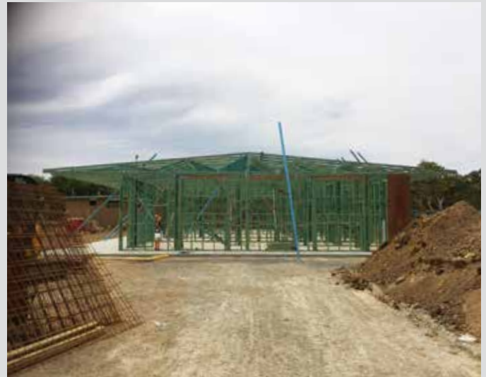
Serpentine sports lovers have enjoyed watching their vision come to life in recent months.

Residents will also be pleased to discover that $225,500 has been committed to installing new drainage, kerb and channelling along Chapel Street.